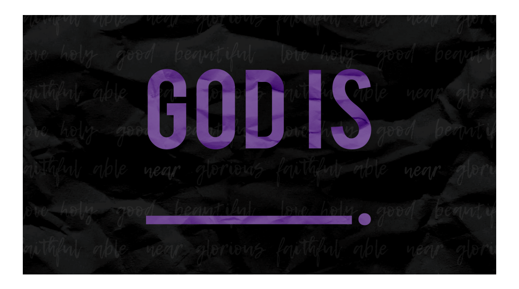
Almighty,' who was, and is, and is to come."

9 Whenever the living creatures give glory, honor and thanks to him who sits on the throne and who lives for ever and ever, 10 the twenty-four elders fall down before him who sits on the throne and worship him who lives for ever and ever. They lay their crowns before the throne and say: