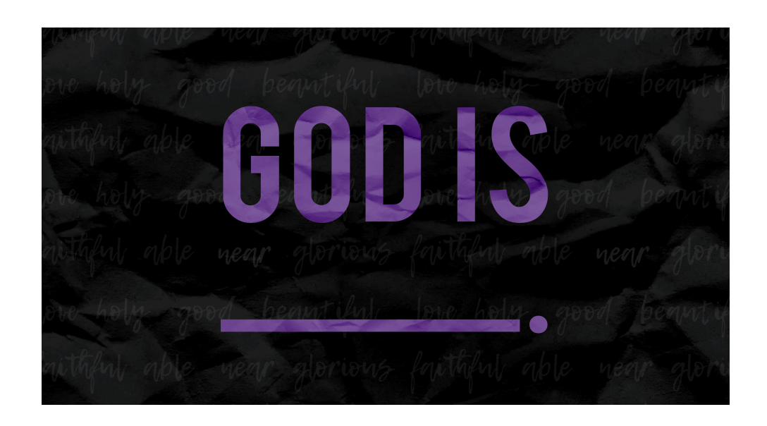
Genesis 1:1-31; Revelation 21:1-7